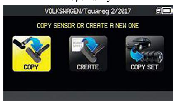
Program Aftermarket Sensors