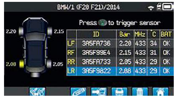
TPMS Sensor Intelligence