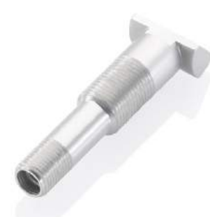
Valve stem for sensor type 1C.