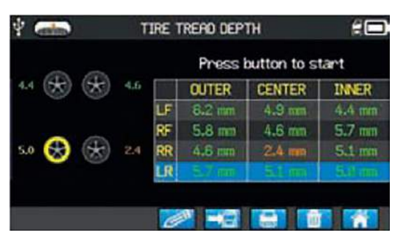
Green, yellow and red colour codes indicates wear against the threshold