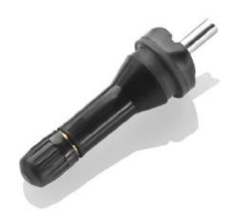
Valve stem for sensor type 1D.