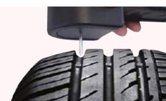
Optional Tyre Tread Gauge