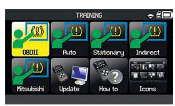
Help & Training