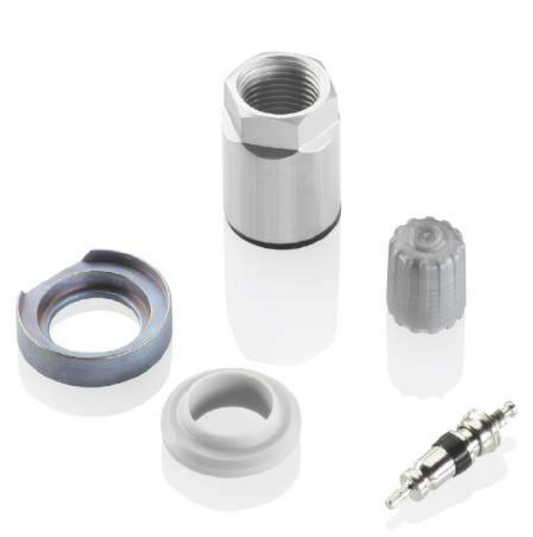
Service kit: valve insert, mounting nut, seal, seal washer and valve cap.

Our portfolio includes not only the sensors but also the corresponding service kits, consisting of mounting nut, valve insert, seal, seal washer and valve cap. For service activities at the tyre, the replacement parts portfolio is rounded off by valve stems for the sensor designs TG1C (Clamp-in) and TG1D (Snap-in).